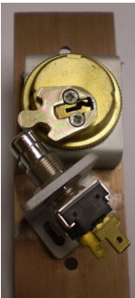
9970 Momentary Metal Button

NC is on the left. COM is in center. NO is on the right. NC/COM or NO are not marked on either models.