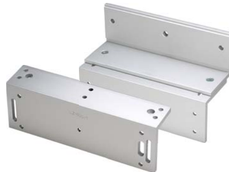
Z-Bracket Sets 21031